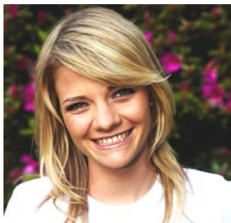
JESSICA WATSON OAM INVERLOCH CLASSIC WOODEN DINGHY REGATTA AMBASSADOR