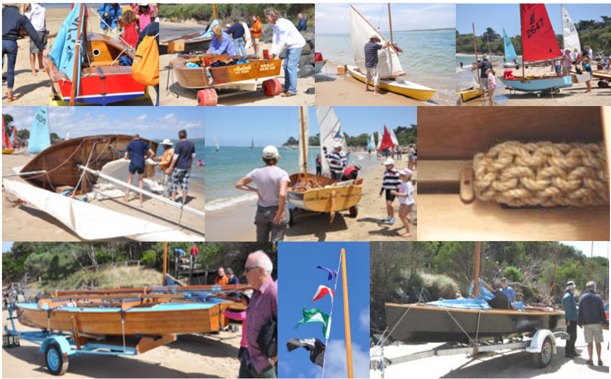
It was great to see the see the 12 sq metre, on the lower right, from the Royal Sydney Yacht Squadron.