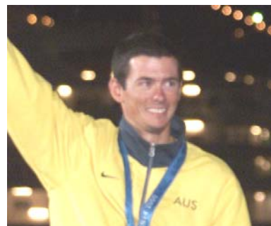
TOM KING OAM INVERLOCH CLASSIC WOODEN DINGHY REGATTA PATRON