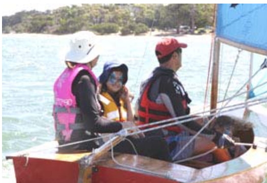
The Chapman Family's 'The Heron' Heron 5028. Rotary Club Plaque and AUS Sails kit bag for Best Dinghy in Original Condition