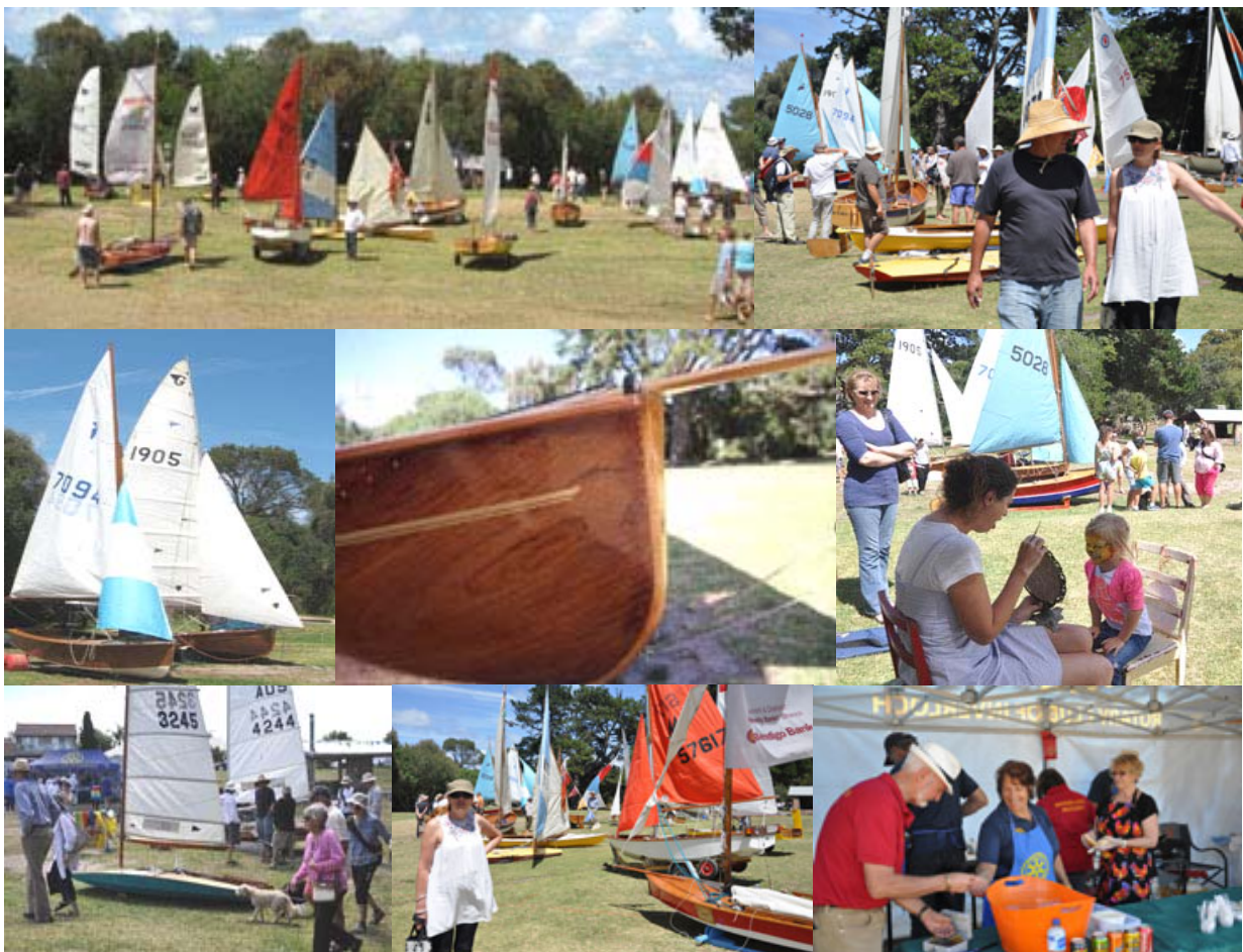
The Rotary Club set up their catering marquee in 'The Glade' and provided lunch for hungry sailors and visitors whilst face painting was popular with kids.